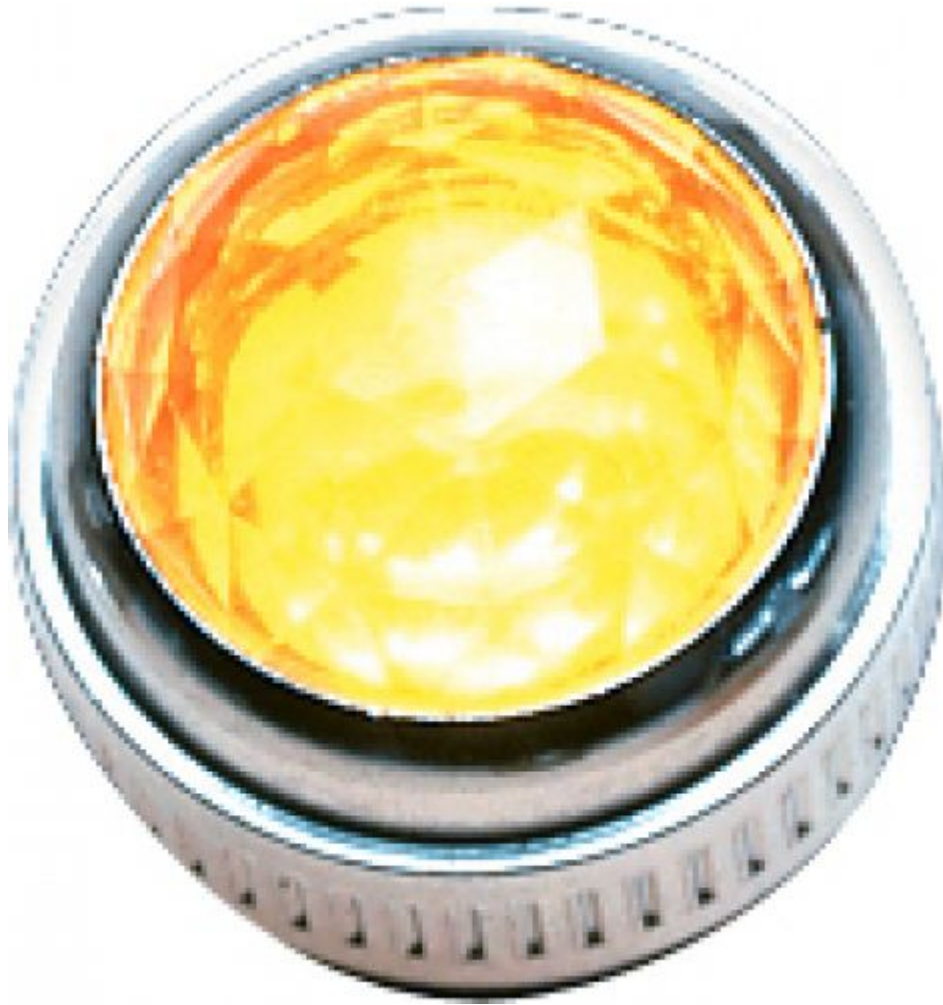
Fender Amp Jewel, Amber