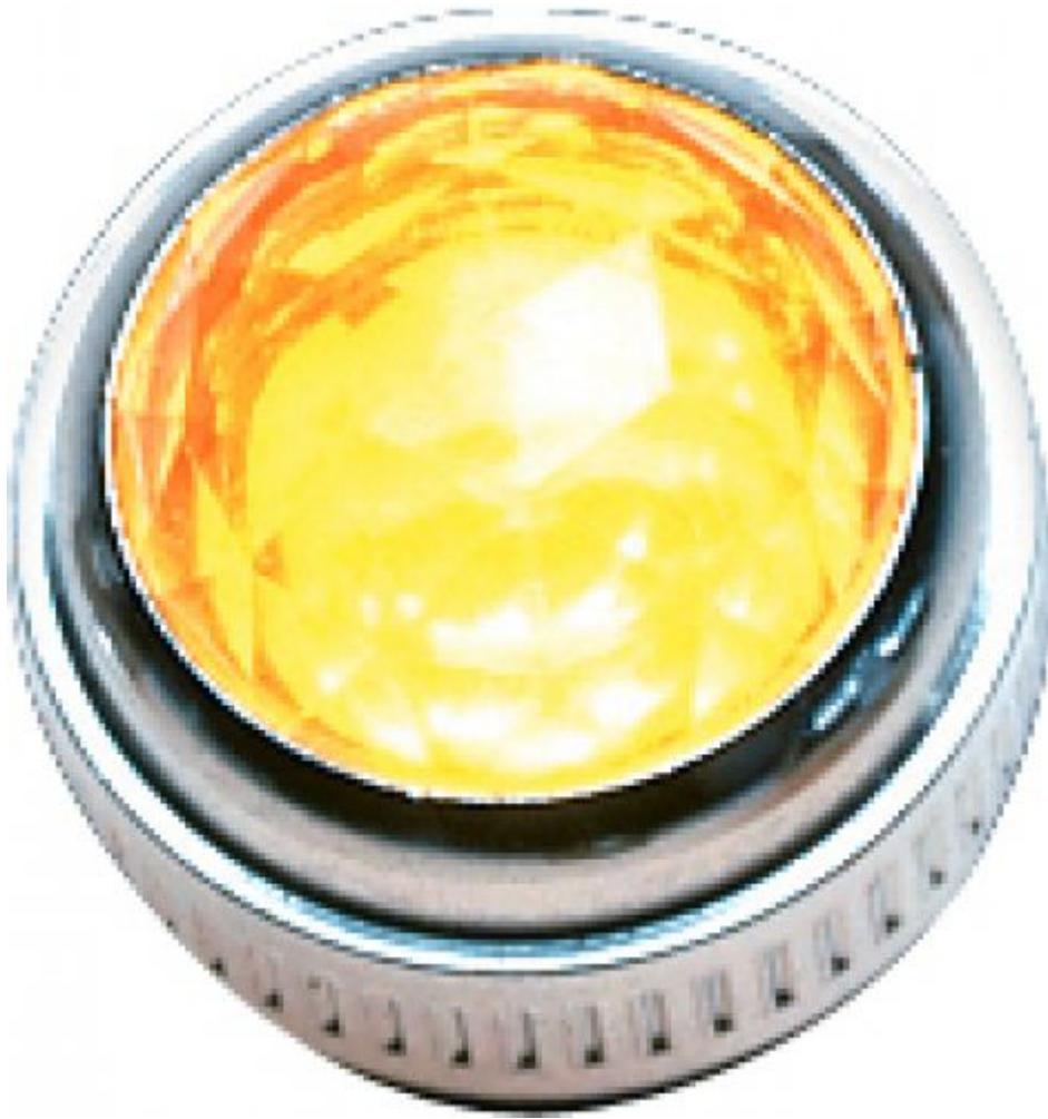
Fender Amp Jewel, Amber