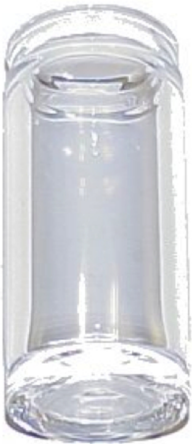
Blues Bottle Glass Slide, Heavy Wall, Small

The Blues Bottle® slide will take you back to pre- Depression Mississippi, where Blues Masters used medicine-bottle slides to form the roots of modern day blues. Blues Bottle® slides are individually hand blown of durable, seamless Pyrex glass for a crisp, bright tone. The weighted, closed ends provide optimum balance.