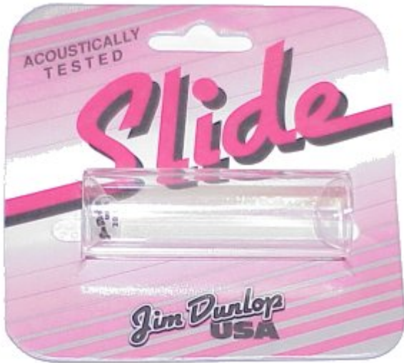
Pyrex Glass Slide, Regular Wall, Medium

Dunlop Tempered Glass Slides offer a warmer, thicker tone accentuating the middle harmonics of your sound. Processed from high quality boron silicate. Heat treated and annealed for a flawless tube.