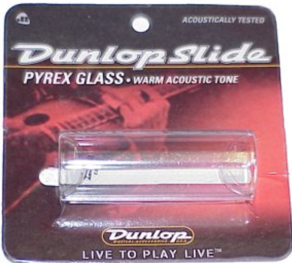
Pyrex Glass Slide, Regular Wall, Large

Dunlop Tempered Glass Slides offer a warmer, thicker tone accentuating the middle harmonics of your sound. Processed from high quality boron silicate. Heat treated and annealed for a flawless tube.