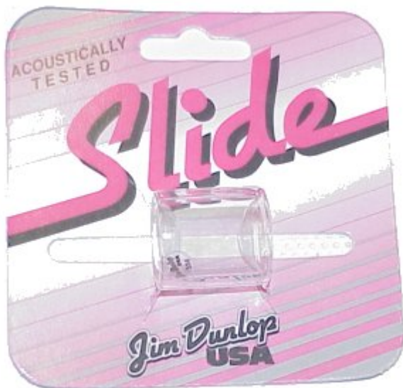
Pyrex Glass Slide, Short Knuckle

Dunlop Tempered Glass Slides offer a warmer, thicker tone accentuating the middle harmonics of your sound. Processed from high quality boron silicate. Heat treated and annealed for a flawless tube.