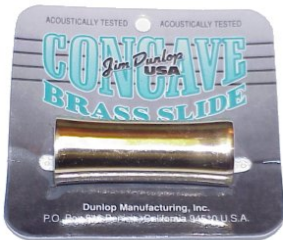
Concave Brass Slide, Heavy Wall, Medium

Specially designed for 12" radius curved-neck guitars, the Dunlop Concave Brass Slide makes contact across all six strings—perfect for acoustic guitars in open tunings.