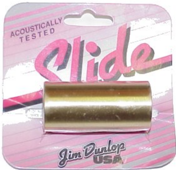
Solid Brass Slide, Heavy Wall, Medium

Brass slides have been preferred for decades for their warm, resonant tone and authoritative mass. Great for coaxing thunderous volume from acoustic guitars.