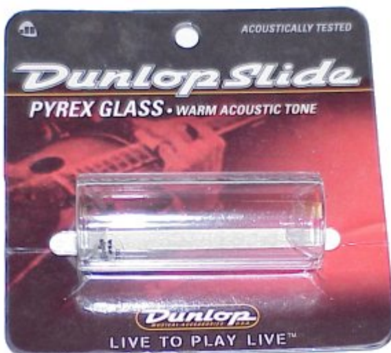
Pyrex Glass Slide, Medium Wall, Medium

Dunlop Tempered Glass Slides offer a warmer, thicker tone accentuating the middle harmonics of your sound. Processed from high quality boron silicate. Heat treated and annealed for a flawless tube.