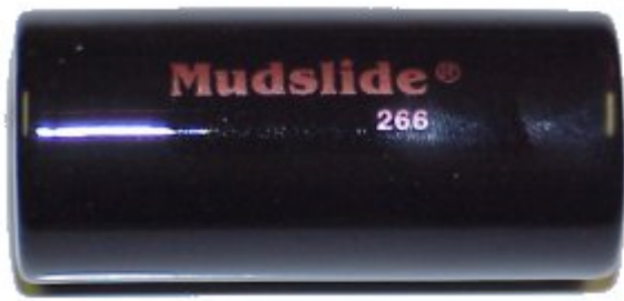
Mudslide, 'Black Porcelain' Ceramic Guitar Slide, Large

The added density of porcelain provides a tone that is warmer than glass and brighter than brass. The thicker walls provide sustain and a comfortable heft. The Mudslide's silky interior absorbs finger moisture to reduce slipping.