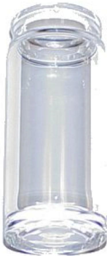
Blues Bottle Glass Slide, Heavy Wall, Medium

The Blues Bottle® slide will take you back to pre- Depression Mississippi,