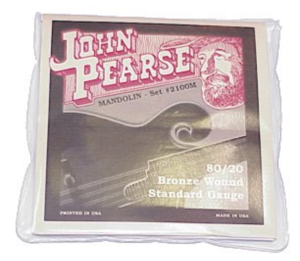
Mandolin Stings, Standard Gauge