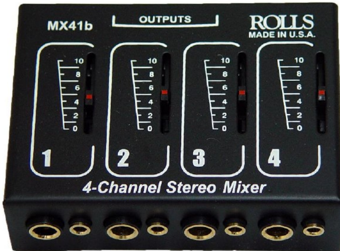
Rolls MX41b 4-Channel Passive Mixer