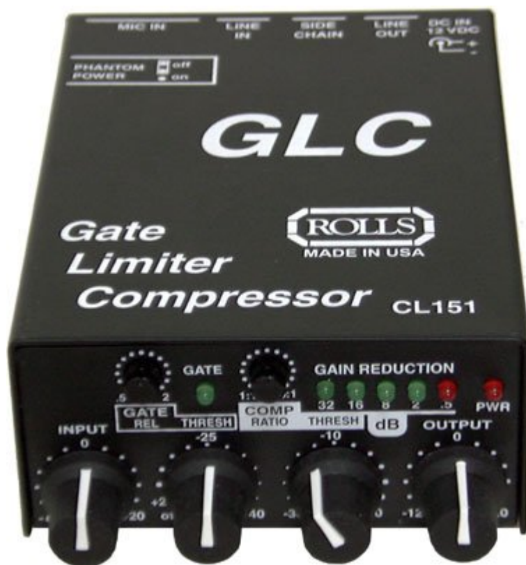
Gate Limiter Compressor / Mic Preamp