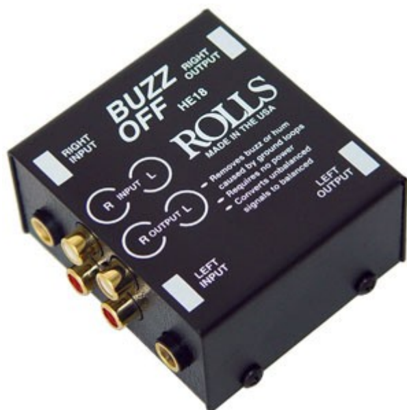
Rolls HE18 Buzz Off