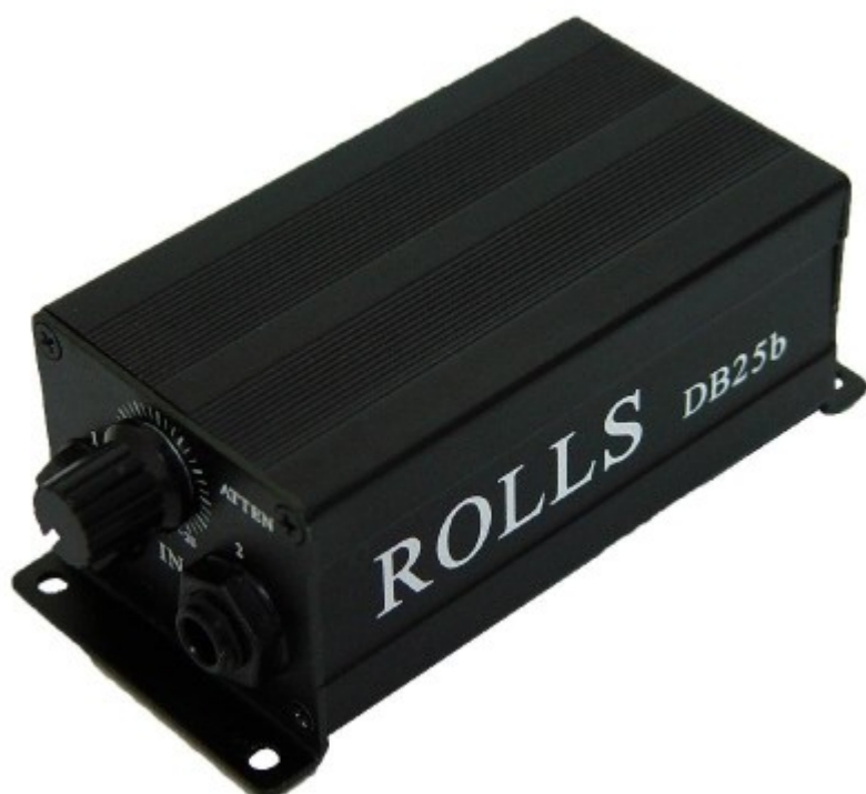
Direct Box, With Pad & Ground Lift