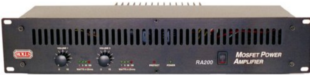
Stereo 100 Watts Per Channel Power Amp